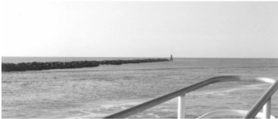
The Little River jetties completed in 1983 by the U.S. Army Corps of Engineers. This allowed deep draft vessels to transit the bar on any tide.