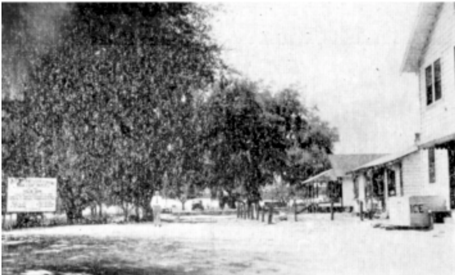
The Little River water front in 1948, looking south. The docks are to the left. Note the unpaved road.