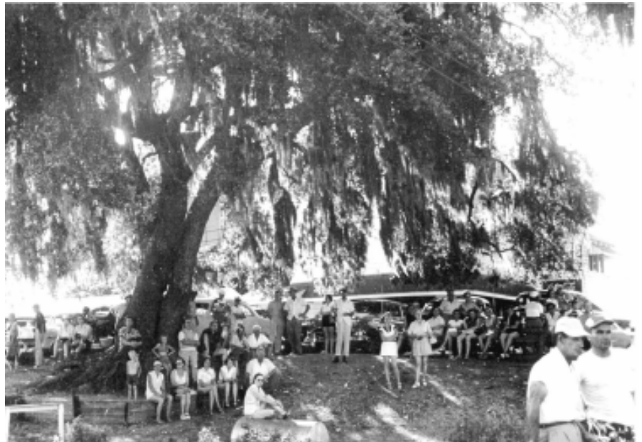
People waiting under the oaks for the fishing boats to return from fishing trips. Some came from the nearby beaches to see the boats and catches, some came to pick up family who went out on the boats and others were waiting around to arrange a trip themselves.

The end of World War II allowed party fishing to resume. However, offshore recreational fishing did not