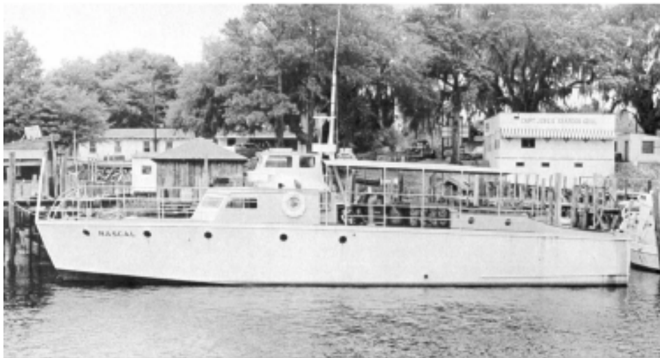
Vivan Bessent's first Rascal . She was a World War II air sea rescue boat converted for bottom fishing.