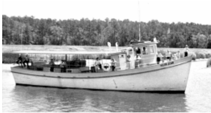
The first Helen Jean prior to 1954. At this time she was 55 feet long. After Hurricane Hazel she was lengthened to 65 feet.