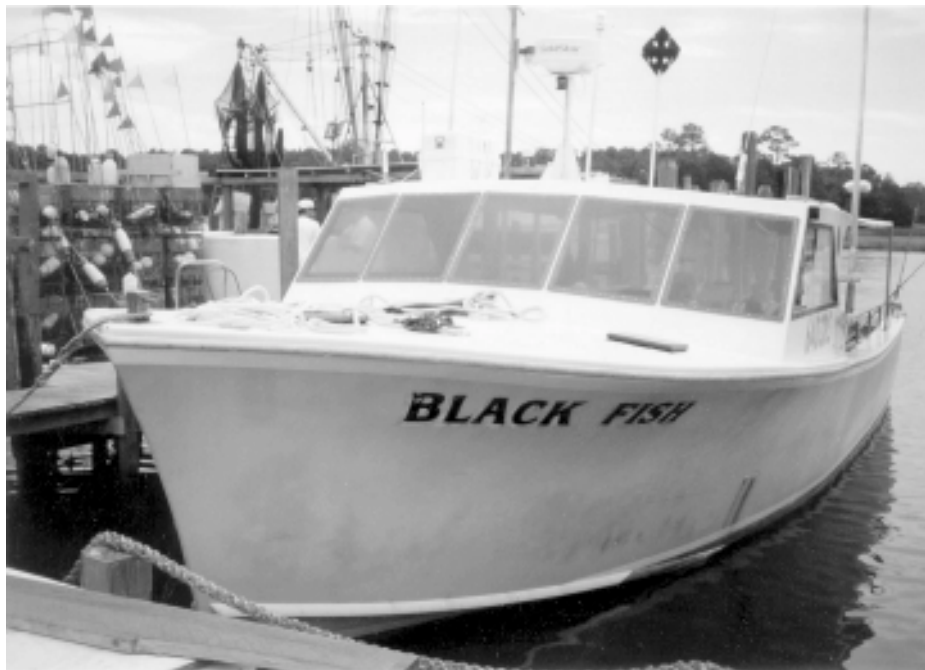
Larry Long's Black Fish . He charts her during the summer to recreational fishermen and pots for black sea bass in the off season.