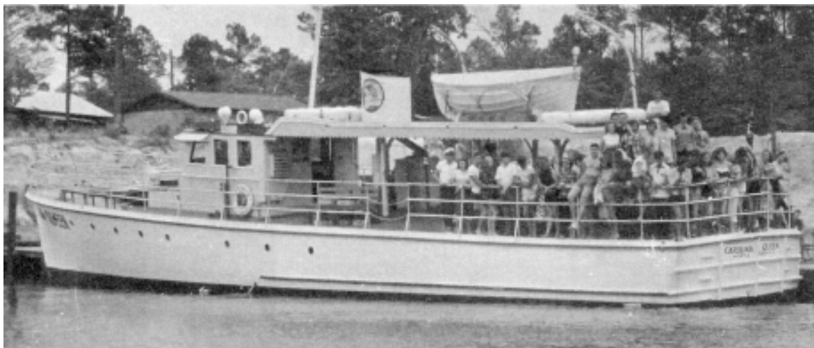
Sam Gardner's Ocean Queen in the early 1950s. This was an 84 foot air sea rescue boat converted for recreational fishing.