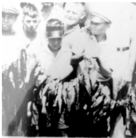
Boys from the YMCA Camp Nixon with blackfish caught on the Josephine. Mid 1930s.