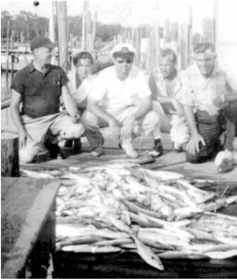
The author and party with a catch of several hundred Spanish mackerel in 1954.