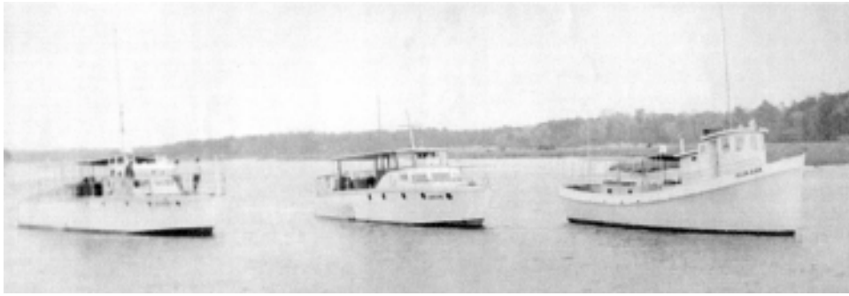
Head boats waiting for the tide to rise enough for them to cross Little River Bar, 1950s.